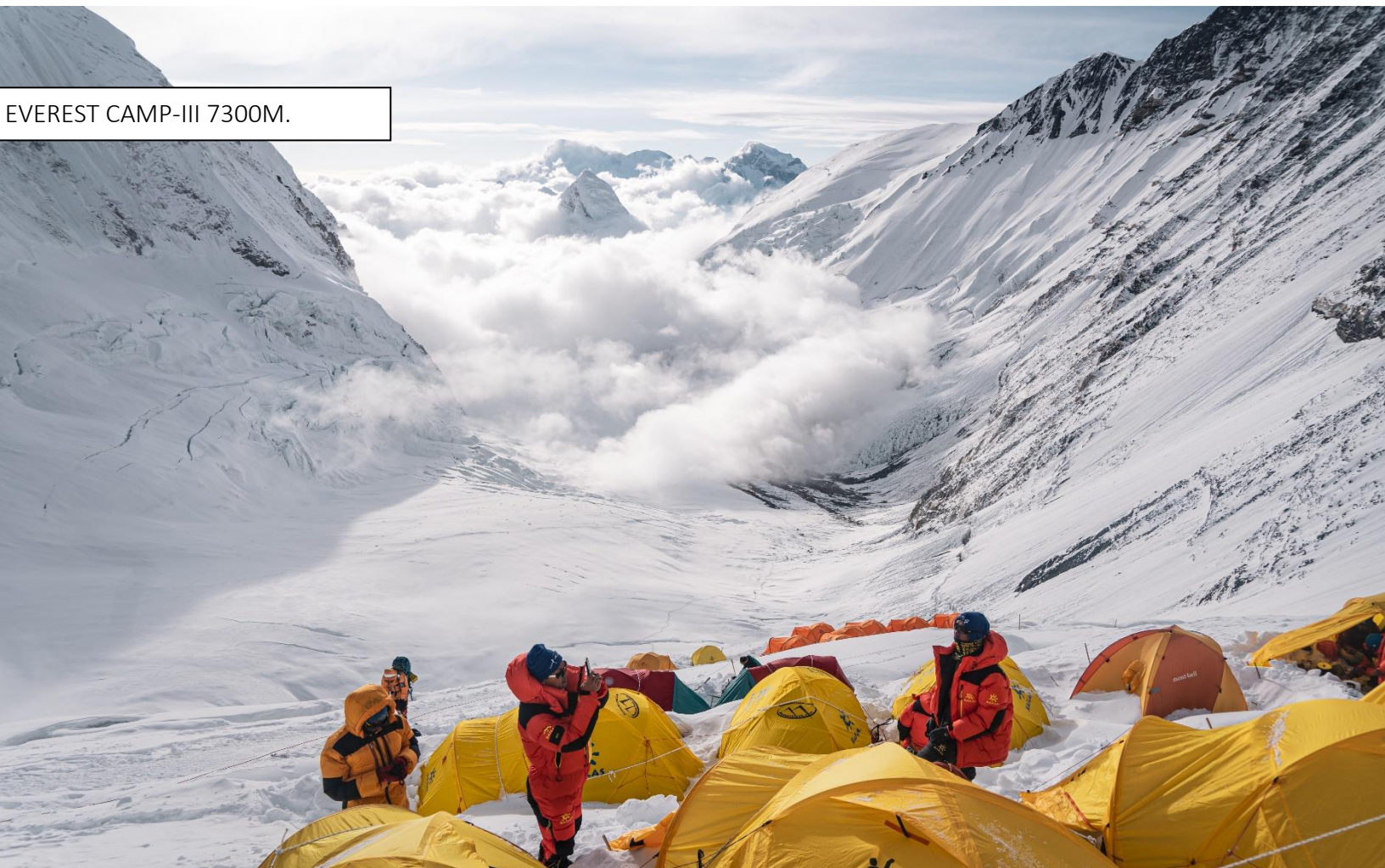
EVEREST CAMP-III 7300M.

" We await to serve you our service and share our experience with you "